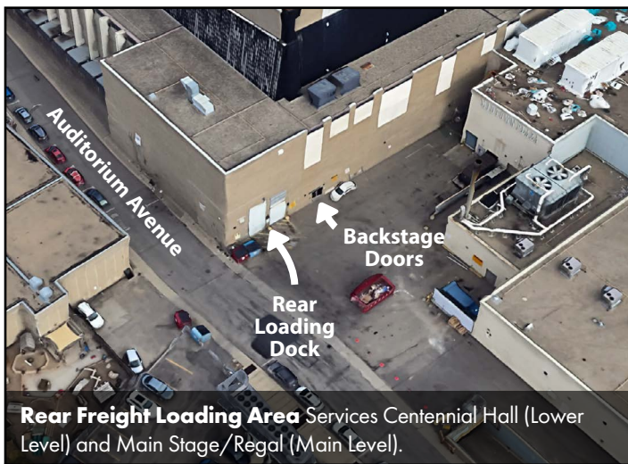
Rear Freight Loading Area Services Centennial Hall (Lower Level) and Main Stage/Regal (Main Level).

Rear Freight Elevator 11' wide, 19' long, 8' high Load capacity 10,000 lbs.