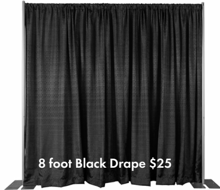
8 foot Black Drape $25

Prices listed here assume orders are placed a minimum of 6 weeks in advance of your event - higher prices will apply to rental items requested on day of event.