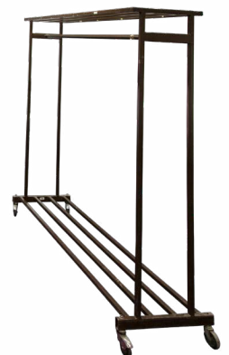
Rolling Rack $15