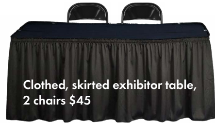
Clothed, skirted exhibitor table, 2 chairs $45