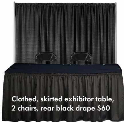
Clothed, skirted exhibitor table, 2 chairs, rear black drape $60