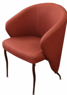
Burgundy Chair $30