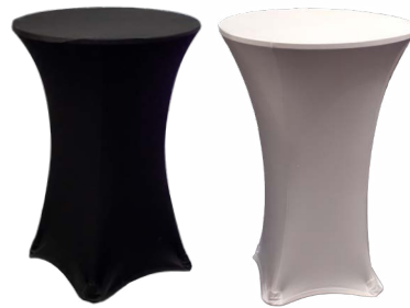
30" Tall Round Table with Spandex Cover (or Short Cocktail Table with Cloth) $25