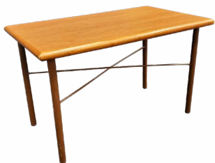
Coffee Table $15