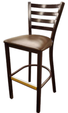
Bar Stool $20