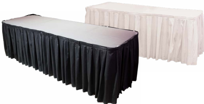
Additional table with skirt (4', 6' or 8' available) $25