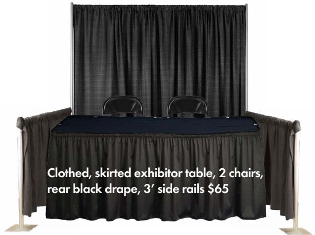
Clothed, skirted exhibitor table, 2 chairs, rear black drape, 3' side rails $65